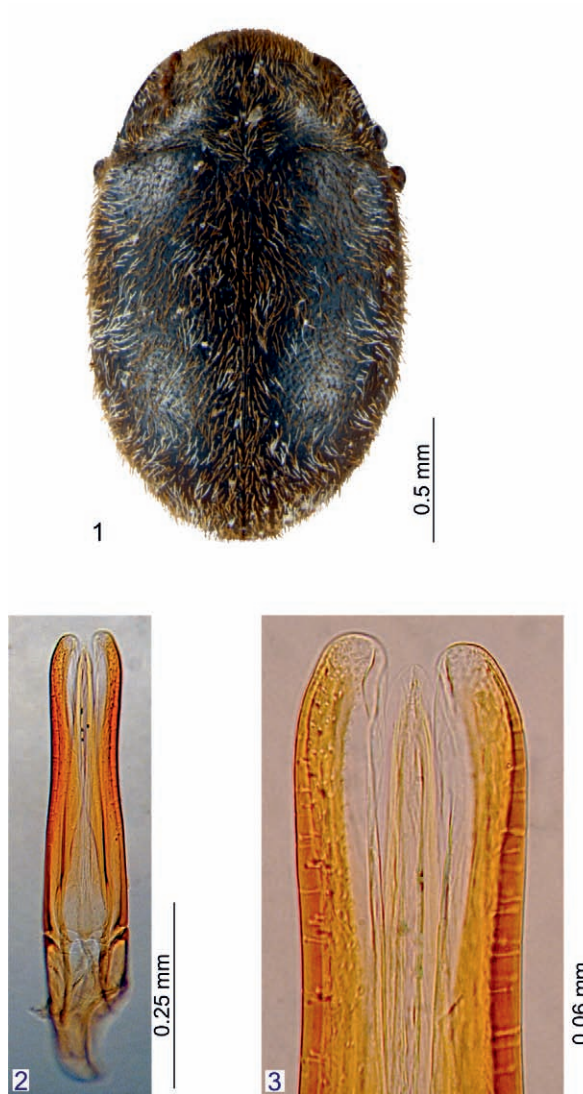
Fig. 1: Habitus photograph of Pelochares fauveli (paratype). Figs. 2–3: Aedeagus of Pelochares fauveli (holotype), dorsal view.

Aedeagus as in Figs. 2–3. Median lobe shorter than parameres, acuminate. Parameres ca. twice as long as phallobase; apex round. Phallobase asymmetrical, with short struts. No other genital segments are preserved for the holotype.